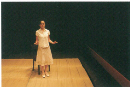
Fly Entertainment Artists

Starting out as a language lesson with the audience, National Language Class stages multiple versions of Chua's iconic painting in a bid to get to grips with history, and resolve simmering tensions between teacher and pupil. As it develops into a power-play by turns humorous and menacing, tender and explosive, the performance asks: what is the relationship between who you are and the language you speak? And what does it mean to take a new language on - or give one away?